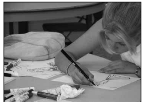
Skills practice: Basic shapes to complex ideas!