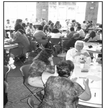
City officials were present to listen to neighbors' ideas.