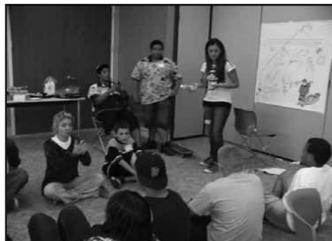
All participate in team-building games.