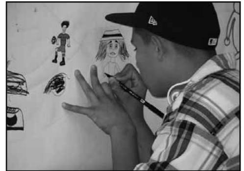
Youth draw to capture summer experiences.