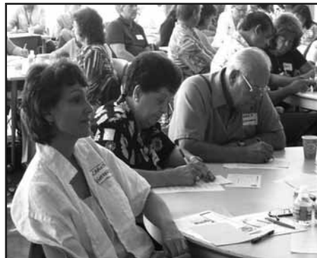
Residents worked in groups, sharing their ideas for Bryte and Broderick's future.